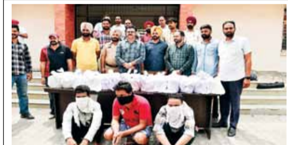
Special Task Force of Punjab Police (STF) personnel display 41kg of recovered heroin from three alleged smugglers during a press conference, in Amritsar on Wednesday. STF has arrested 03 accused involved in cross border smuggling which was smuggled through Ravi river from Pakistan side.

for children to showcase their talent and creativity to the public, while also generating earnings for them. The ultimate goal is to boost their confidence, instill a sense of self-dependence, and develop resilience among the children. By organizing such events, the Department of Social Welfare not only supports the children in Snehalaya for Boys but also promotes their integration into society.