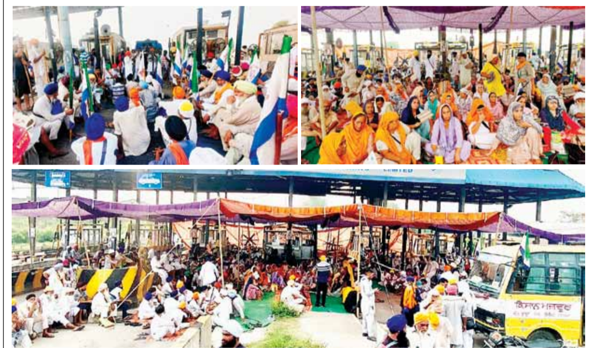
Farmers block a toll booth on the national highway at Toll Plaza near village Nijjer Pura in Jandiala Guru on the outskirts of Amritsar on Tuesday. Protest was held against the arrest of their colleagues ahead of a farmers' tractor march to Chandigarh.