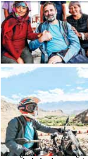
He reached Khardunga Top in Ladakh on Monday. Khardunga is said to be the highest motorable road of the world.

Rahul Gandhi also posted the pictures of Leh market where thousands of locals can be seen with him. Bharat Jodo is deeply rooted in every Indians's Heart and mind. Everybody was seen chanting "Bharat mata ki jai" No power can suppress this unity, Rahul said. "This is 'Mohabat ka safar which will keep on moving' he added. Not only the congressmen but the people of ladakh are happy and welcoming their leader with love and affection.