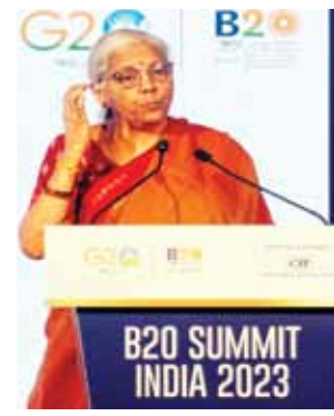
B20 SUMMIT INDIA 2023

EFTA includes Liechtenstein, Norway, Iceland, and Switzerland. "We need to quickly diversify our supply chains. Well-functioning international markets