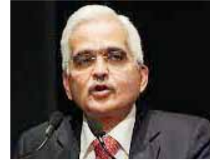
FW DESK New Delhi

"We expect (retail) inflation to start coming down from September. Although August's (retail) inflation will be very high, we expect inflation to start coming down from September. Tomato prices have already fallen and retail prices of other vegetables are also expected to come down from this month, he said. Das said the government has taken several steps to ensure affordable supply of tomatoes and other items of common need to the people. "Restrictions have been imposed on the export of non-basmati rice. The prices of LPG cylinders used in