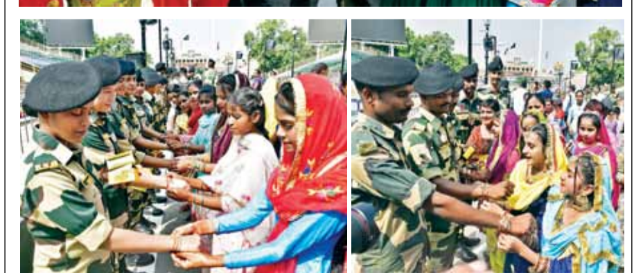
Girls tying rakhi on the wrists of Border Security Force (BSF) Jawans on the occasion of Raksha Bandhan festival at the India-Pakistan joint border check post of Attari-Wagah border, about 35 kilometers (22 miles) from Amritsar on Thursday.