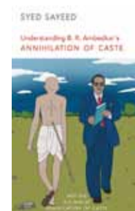
Understanding B.R. Ambedkar's Annihilation of Caste By Syed Sayeed Permanent Black 252 pages, Rs 595

While Sayeed's work is a summary of Ambedkar's Annihilation of Caste, it also seems to be a cri-