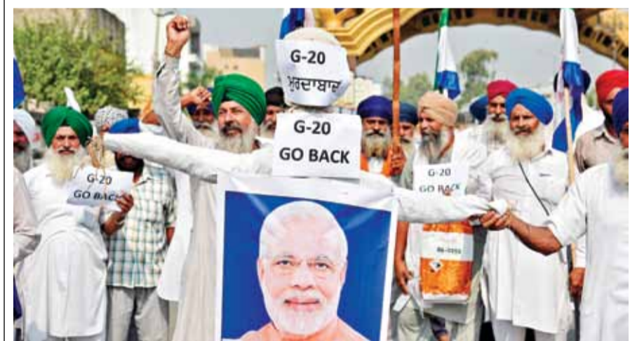
Farmers from Punjab shout slogans as they hold effigy of Indian Prime Minister Narendra Modi during a protest against upcoming G20 summit, which will be held in India.

Los Angeles, Sep 7 (IANS) Hollywood star Leonardo DiCaprio has seemingly moved on from his on-and-off relationship with supermodel Gigi Hadid by dating another model Vittoria Ceretti as the two were spotted during a night out.