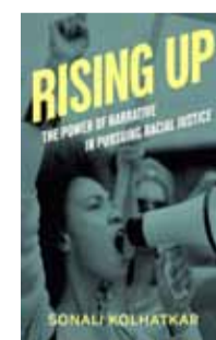
Rising Up: The Power of Narrative in Pursuing Racial Justice By Sonali Kolhatkar City Lights 144 pages, Rs 1,461 (Kindle)

Kolhatkar's narrative is not just a critique but also a guide. She meticulously maps out the journey of activists, writers, and everyday citizens who have dared to challenge the status quo. Through their stories, readers are introduced to