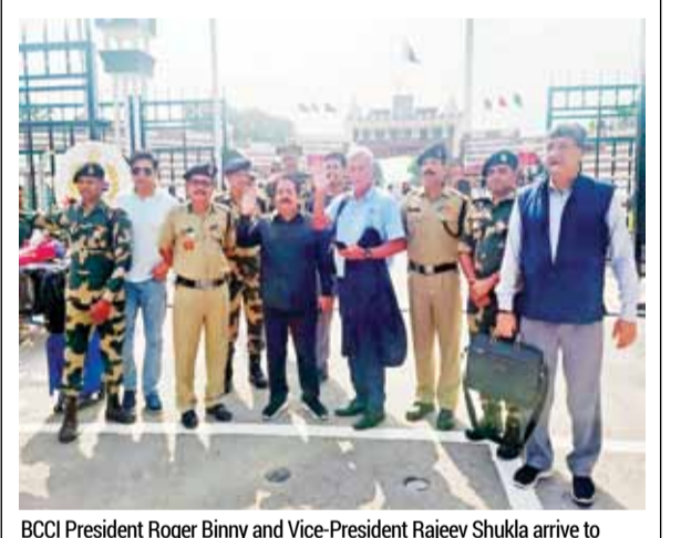
BCCI President Roger Binny and Vice-President Rajeev Shukla arrive to cross the Attari-Wagah border to visit Pakistan for Asia Cup 2023, about 35 kilometers (22 miles) from Amritsar on Monday.

per-4 that has a reserve day is India against Pakistan; all other matches will be cancelled in case of rain. Earlier, on September 2, the match between India and Pakistan was called off due to weather. Due to rain in the middle of the match, only one innings could be played and no balls could be thrown in the second innings. India won the toss and batted first, scoring 266 runs. Neither the spectators on the field nor those watching the India-Pakistan encounter after a year on TV could enjoy the match adequately.