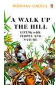
A Walk Up The Hill: Living with People and Nature By Madhav Gadgil Penguin Allen Lane 412 pages; Rs 999

The author's deep connection to the Western Ghats paints a vivid