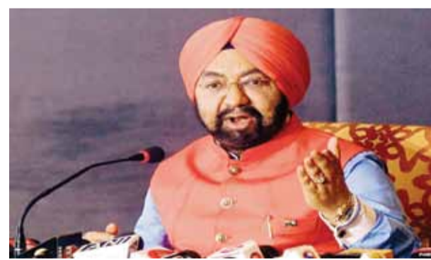
CHANDIGARH: Member of Parliament from Punjab, Vikramjit Singh Sahney, on Friday responded to Indian political dispute with Canada by saying "he always strongly believe dialogue is the only solution to every diplomatic problem".

Sahney expressed concern on the statement of Canadian Prime Minister Justin Trudeau for his exaggerated allegation on India.