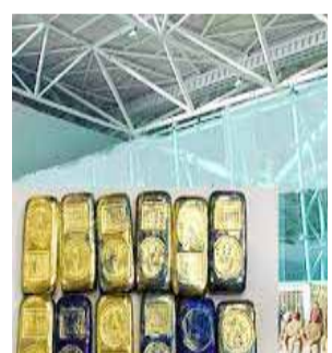
JAGMOHAN SINGH Amritsar

Custom officials have seized 24 carat gold purity was seized having a market value of Rs. 68,67,654 from passenger who have arrived here from Dubai by Spicejet flight.