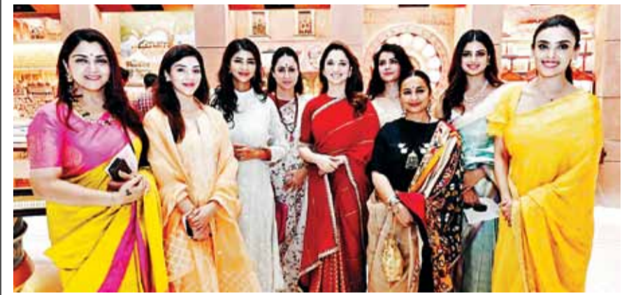
WOMEN CELEBRITIES IN PARLIAMENT

The film will release worldwide on December 1, in five languages - Hindi, Telugu, Tamil, Kannada, Malayalam.