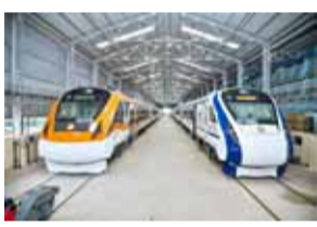
ARUN KUMAR RAO Bengaluru

The new Vande Bharat Express between Bengaluru and Hyderabad trial run, managed to cover the distance between Hyderabad and Bengaluru in slightly over seven and half hours. The two destinations are 610 km apart. South Western Railway (SWR) officials said introduction of Vande Bharat on the route will help passengers in a big way as it will reduce travel time and make travel more comfortable. The train left Kacheguda at 5.30 am and reached Yeshwantpur station in Bengaluru around 1.15 pm. In the return direction, it departed from Bengaluru around 2 pm. Hanning composition of eight cars, the train can carry 530 passengers, including 390 in regular coaches, 52 in executive chairs and 88 in motor cars.