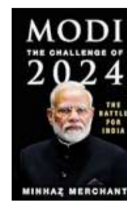
Modi: The Challenge of 2024 - The Battle for India By Minhaz Merchant Amarjyllis 456 pages; Rs899

Beyond the political intricacies, Merchant's book also offers a socio-economic perspective. He delves into the implications of Modi's policies on the Indian economy, examining both the successes and the areas needing attention. The book provides a holistic view, considering the global economic landscape and India's posi-