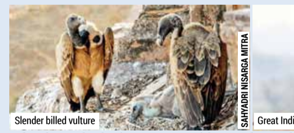
Slender billed vulture