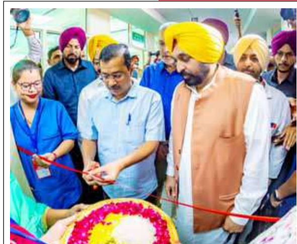
Punjab Chief Minister Bhagwant Mann and Delhi Chief Minister Arvind Kejriwal at the newly revamped Mata Kaushalya Hospital, in Patiala on October 2.