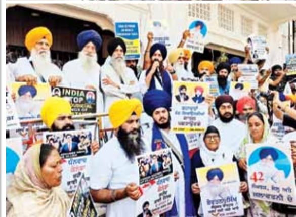
Activists of the Dal Khalsa Sikh organisation, a pro-Khalistan group, stage a demonstration demanding justice for Sikh separatist Hardeep Singh Nijjar, who was killed in June 2023 near Vancouver, after offering prayers at the Akal Takht Sahib.