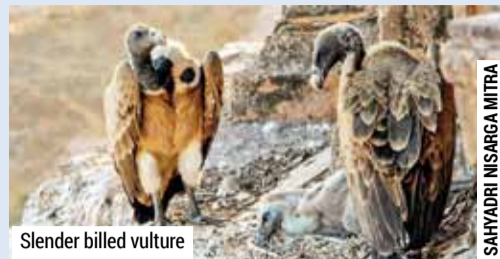
Slender billed vulture

Birds in the region are currently confronted with many threats, the most important of which are habitat loss and degradation, followed by human wildlife conflict. Root causes of damage to and loss of habitats are complex and interlinked. These include urbanization, infrastructural development, current agricultural practices, threat to natural forest cover due to over exploitation, high overseas demand for resources,