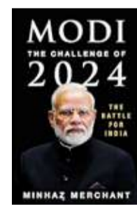
Modi: The Challenge of 2024 - The Battle for India By Minhaz Merchant Amarjyllis; 456 pages; Rs899

Beyond the political intricacies, Merchant's book also offers a socio-economic perspective. He delves into the implications of Modi's policies on the Indian economy, examining both the successes and the areas needing attention. The book provides a holistic view, considering the global economic landscape and India's posi-