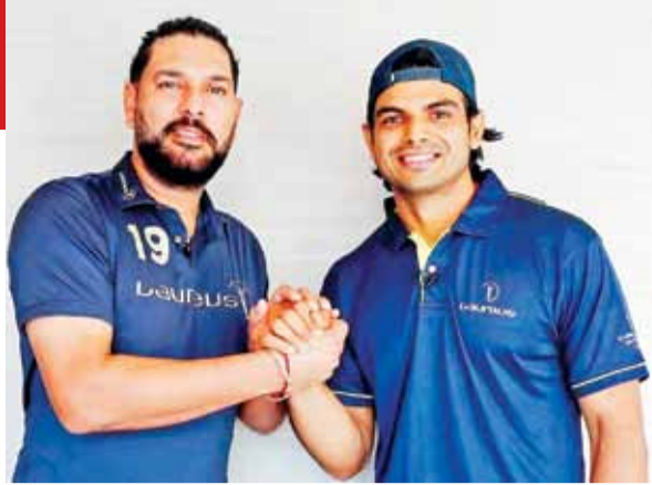
Neeraj Chopra goes back to 2022, when he was nominated in the Breakthrough of the Year category at the Laureus World Sports

Neeraj Chopra, the reigning Olympic, World and Asian champion in men's javelin, was today named a Laureus Ambassador, pledging his support to Laureus Sport for Good, the global foundation supporting over 300 programmes that use sport to eradicate inequality and discrimination for young people around the world.