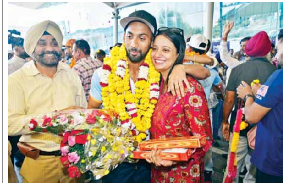
19th Asian Games gold medalists winning Indian Hockey team players are welcomed by fans and family members as they arrive at the Sri Guru Ram Dass Jee International Airport, in Amritsar on October 11.