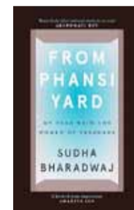
FROM PHANSI YARD: My Year with the Women of Yerawada By Sudha Bharadwaj Juggernaut Publication; 264 pages; Rs 799

In "From Phansi Yard," readers are not only offered a glimpse into the life of a fearless activist but are also challenged to reflect on their own roles in upholding justice and equality. This book is a must-read for anyone interested