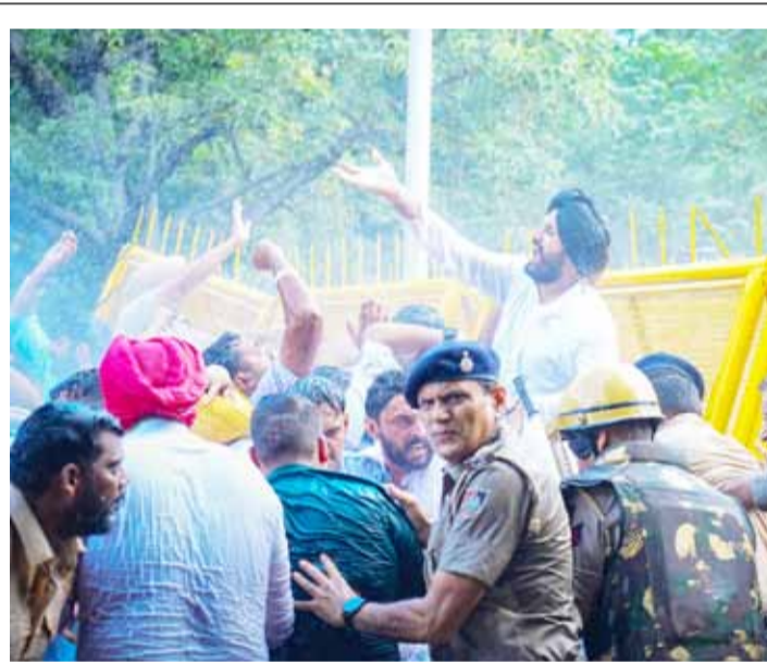
Punjab Congress workers marching towards the Punjab Raj Bhawan over the Sutlej Yamuna Link (SYL) canal issue in Chandigarh on October 9.