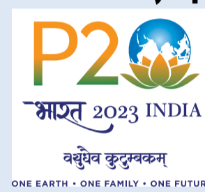
ONE EARTH • ONE FAMILY • ONE FUTURE

Sustainable Energy: Towards a Green Future : India has attempted to adapt its development process to the needs of a green future even while facing the challenges of huge population and