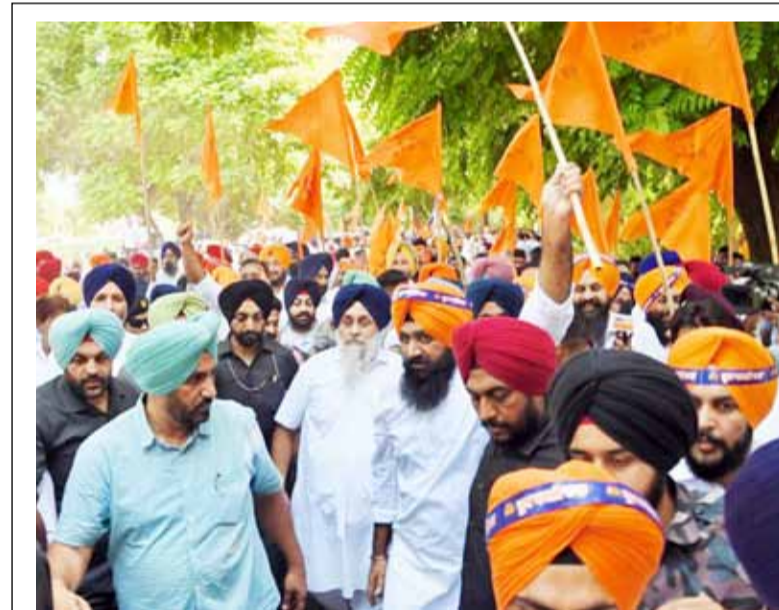
Shiromani Akali Dal (SAD) President Sukhbir Singh Badal along with other leaders and workers marching towards Gero Punjab Chief Minister Bhagwant Mann's house over the Sutlej Yamuna Link (SYL) canal issue in Chandigarh on October 10.