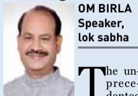
OM BIRLA Speaker, lok sabha

The unprecedented success of the G20 summit chaired by India has been praised all over the world. It is a matter of pride that this Summit concluded with a Joint Declaration strengthening our concept of "Vasudhaiva Kutumbakam" - One Earth, One Family, One Future". G20 also underlined India's growing global influence, as it successfully played the role of a consensus builder.