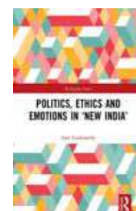
Politics, Ethics and Emotions in 'New India' By Ajay Gudavarthy Routledge 220 pages; Rs4,159

its challenges. Gudavarthy's extensive use of anecdotes, while adding depth, can sometimes detract from the central narrative. Additionally, readers unfamiliar with India's political landscape might find the plethora of names, events, and policies a tad overwhelming.