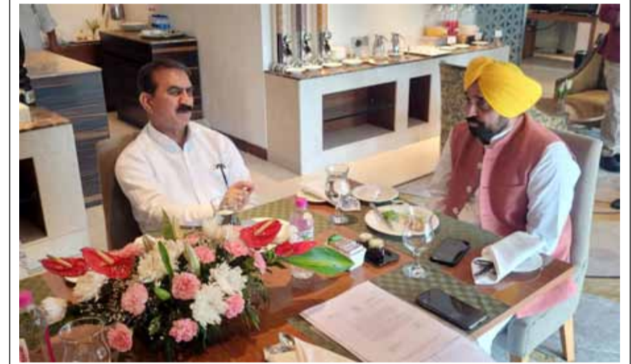
Himachal Pradesh Chief Minister Sukhvinder Singh Sukhu meets Punjab Chief Minister Bhagwant Mann ahead of the 31st Meeting of the Northern Zonal Council, in Amritsar on September 26.

A guarantee law should be made on the purchase of all crops MSP and the rate of all crops should as per the recommendation of the Dr.Swaminathan Commission report, it should be given with a formula of C2+50%. The entire debt of farmers and laborers should be waived off. Telling more about their demands he said that drugs like heroin smack should strictly be curbed in the whole of North India and rehabilitation should be arranged in the society by providing free treatment and employment to the youth addicted to drugs. All the police cases slapped during the Delhi march (protest) be canceled, justice should be done in the LakhimpurKhiri murder case and Central Minister Ajay Mishra should be lodged behind the bars as per law, he said.