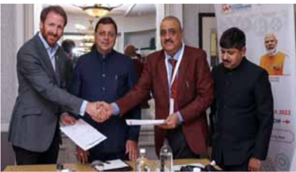
Up to 80 business houses from various fields like education, tourism, IT, and health sectors of London participated in the main event organized in London.

As per reports, MoU worth Rs 380 crore were signed with Kayan Jet, while investment agreements totalling Rs 100 crore were signed with Usha Breco.