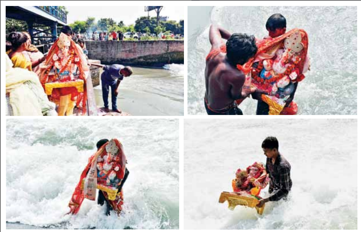
Hindu devotees carry idols of the elephant-headed Hindu god Ganesha for immersion into a canal on the final day of the 10 days long Ganesh Chaturthi festival in Amritsar on Thursday. The festival is a celebration of the birth of Ganesha, the Hindu god of wisdom, prosperity and good fortune.

Pakistan team for the World Cup Babar Azam (captain), Shadab Khan, Fakhar Zaman, Imam-ul-Haq, Abdullah Shafiq, Mohammad Rizwan, Saud Shakeel, Iftikhar Ahmed, Salman Ali Agha, Mohammad Nawaz, Usama Mir, Haris Rauf, Hasan Ali, Shaheen Afridi, and Mohammad Wasim.