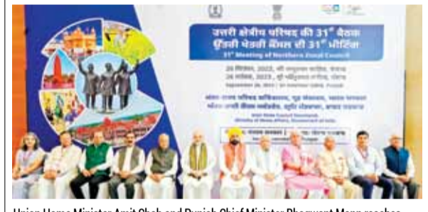
Union Home Minister Amit Shah and Punjab Chief Minister Bhagwant Mann reaches at Taj Hotel to attend the 31st Northern Zonal Council Meeting in Amritsar on Tuesday, September 26. Union Home Minister Amit Shah and Punjab Chief Minister Bhagwant Mann during the 31st Northern Zonal Council Meeting at Taj Hotel in Amritsar on Tuesday. Union Home Minister Amit Shah reaches at Taj Hotel to attend the 31st Northern Zonal Council Meeting in Amritsar on Tuesday. Punjab Chief Minister Bhagwant Mann and Haryana Chief Minister Manohar Lal Khattar also seen in Pic. Union Home Minister Amit Shah with Governors and Chief Ministers of northern states at the 31st Northern Zonal Council Meeting, in Amritsar on Tuesday.