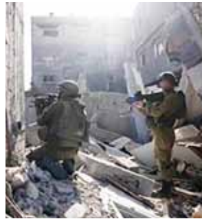
for Israel to occupy Gaza.

A senior White House official said President Joe Biden "believes that a reoccupation of Gaza by Israeli forces is not good" after Prime Minister Benjamin Netanyahu claimed his country "will have the overall security responsibility" in the besieged enclave once the war ends "for an indefinite period". Speaking to CNN on Tuesday, National Security Council spokesman John Kirby said: "The President still believes that a reoccupation of Gaza by Israeli forces is not good. It's not good for Israel; not good for the Israeli people." "One of the conversations that Secretary (Antony) Blinken has been having in the region is what does post-conflict Gaza look like? What does governance look like in Gaza? Because whatever it is it can't be what it was on October 6. It can't be Hamas." Kirby's remarks came a day after Netanyahu told ABC News that he believed Israel will have a role to play for an "indefinite period" once and when the raging fighting ends. "Those who don't want to continue the war of Hamas... It certainly is not -- I think Israel will, for an indefinite period will have the overall security responsibility because we've seen what happens when we don't have it." "When we don't have that security responsibility, what we have is the eruption of Hamas terror on a scale that we couldn't imagine," he told ABC News. Last month, Biden had said that it would be a "big mistake"