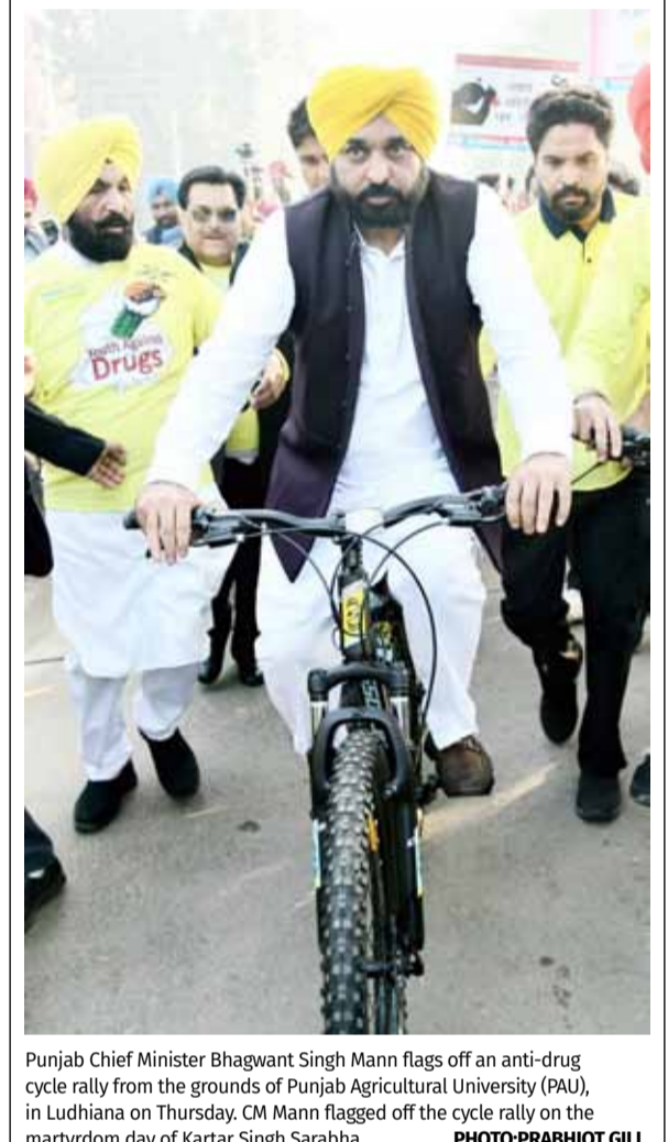
Punjab Chief Minister Bhagwant Singh Mann flags off an anti-drug cycle rally from the grounds of Punjab Agricultural University (PAU), in Ludhiana on Thursday. CM Mann flagged off the cycle rally on the martyrdom day of Kartar Singh Sarabha.

Last date of disposal of claims and objections and communication of decisions by the revising authority thereon to the Deputy Commissioners is 21st April, 2024 and preparations of manuscript of the supplementary roll and printing of supplements are 2nd May, 2024. The date of final publication of the rolls would be May 3rd, 2024.