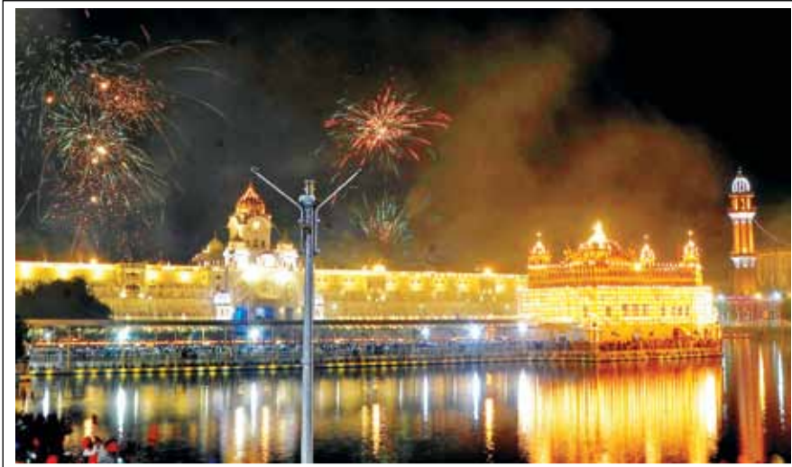
Sikh devotees watch as fireworks explode over the illuminated Sri Harmandir Sahib (Golden Temple) on the occasion of Bandi Chhor Divas .