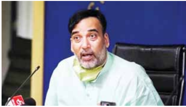
for Air Quality Management).

NEW DELHI: Delhi Environment Minister Gopal Rai on Monday alleged that despite a ban firecrackers were smuggled into the city from the neighbouring states of Uttar Pradesh and Haryana under the nose of the police.