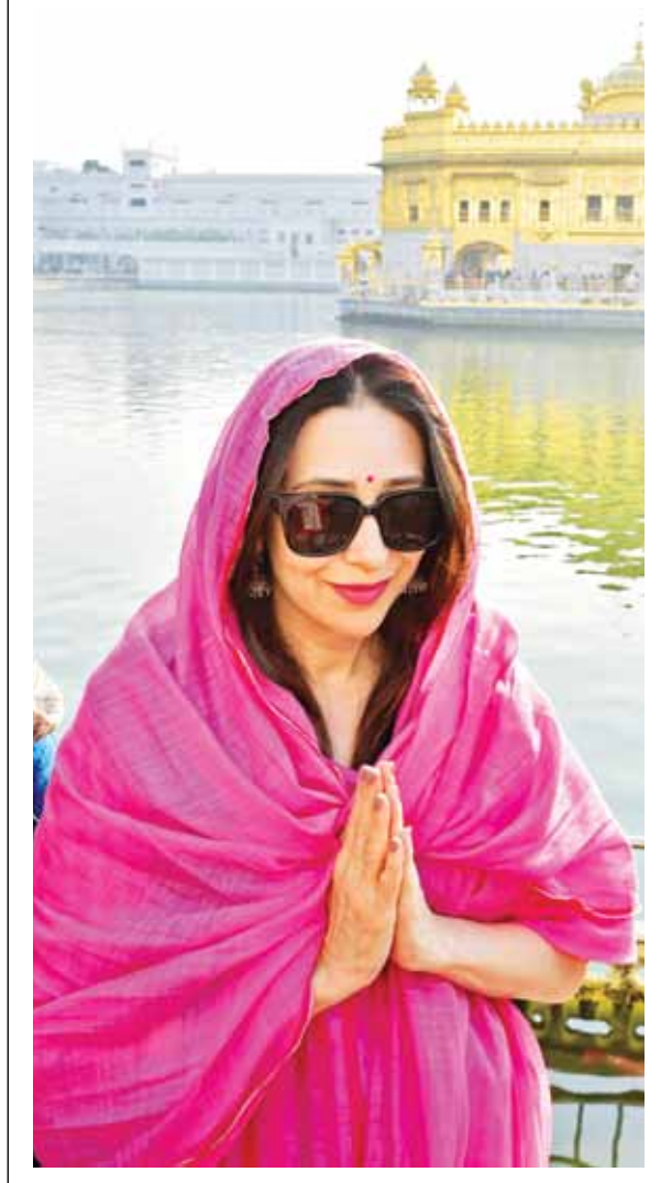
Bollywood actress Karishma Kapoor offers prayers at the Sri Harmandir Sahib (Golden Temple), on Friday.

and Mexico are co-hosting the 2026 FIFA World Cup, which will see major changes with 48 teams taking part here instead of 32. There will be 80 matches at this World Cup, of which America will host the majority. India are currently 106th in the FIFA rankings and therefore cannot qualify on their own. Therefore, India must overcome the difficulty of qualifying. At the World Cup, places are allocated to teams from different associations. If there are 48 teams, the Asian Football Confederation will get 8.5 places. This means that eight teams from Asia can participate.