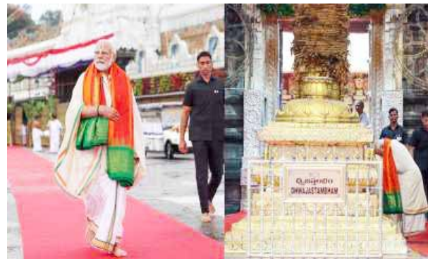
prosperity of 140 crore Indians."

NEWDELHI: Prime Minister Narendra Modi prayed at Sri Venkateswara Swamy Temple in Tirumala, Andhra Pradesh on Monday and also sought blessings of lord Venkateswara Swamy for the good health, well-being and prosperity of 140 crore Indians. Sharing glimpses from Venkateswara Swamy Temple in Tirumala, the Prime Minister posted on X: "At the Sri Venkateswara Swamy Temple in Tirumala, prayed for the good health, well-being and