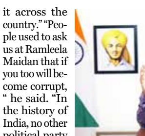
"All agencies of the country were put after AAP but they never found any evidence to this day," he claimed. "This is the biggest certificate of our honesty," the AAP leader said.