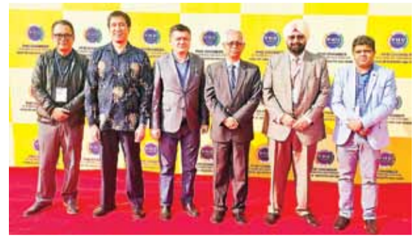
Ambassadors and representatives of Fiji, Bangladesh, Uzbekistan, Indonesia and Kyrgyzstan during the 17th edition of the Punjab International Trade Expo (PITEX), in Amritsar on Friday.