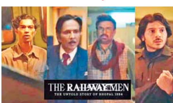
people from dying." The 4-part mini series is set during the 1984

Kay Kay said: "I wish 'The Railway Men' was eligible to be qualified as India's entry to the Oscars. This series shows the world what we, as a country, faced on that fateful night and also shows the spirit of selfless Indians who put their lives at risk to save countless