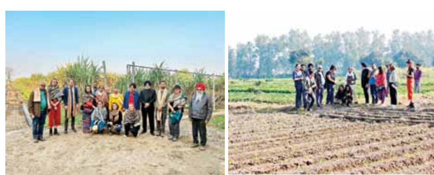
Charles Darwin University Australia visited the Farm of Pingalwara at Dheerokot near Jandiala Guru, in Amritsar on Wednesday.