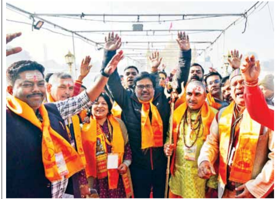
Indian Hindu pilgrims react as they leave for the Katas Raj Temple situated in Pakistan, in Amritsar on Tuesday.

On the acting front, Kareena will next be seen in 'The Crew' and 'Singham Again'.