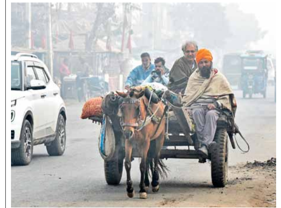
A man rides a horse along a street amid dense fog along a street in the outskirts of Amritsar on Friday. Fog engulfs many parts of the country during the winter months, disrupting normal life and throwing rail and road traffic out of gear.

The suspension was a result of WFI's failure to conduct elections within the deadline set by UWW in August. Consequently, Indian wrestlers had been compelled to compete as neutral athletes in global events over the preceding months.