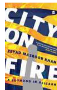
City on Fire: A Boyhood in Aligarh By Zeyad Masroor Khan HarperCollins 312 pages; Rs 599

"City on Fire" is more than just an autobiography; it is a reflection on the Muslim community's struggle against everyday communalism in India. Khan's story is a poignant reminder of the choices and challenges faced by those who chose to