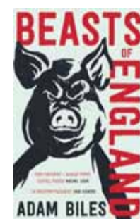
Beasts of England Adam Biles Picador India; 288 pages; Rs599

An example is a scene where animals are coerced into misnaming fruits, which seems a tad heavy-handed in its portrayal of modern totalitarianism, especially in the social media era