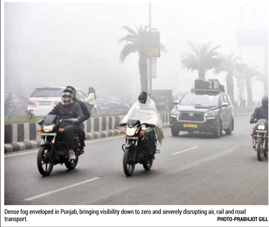
Dense fog enveloped in Punjab, bringing visibility down to zero and severely disrupting air, rail and road transport.