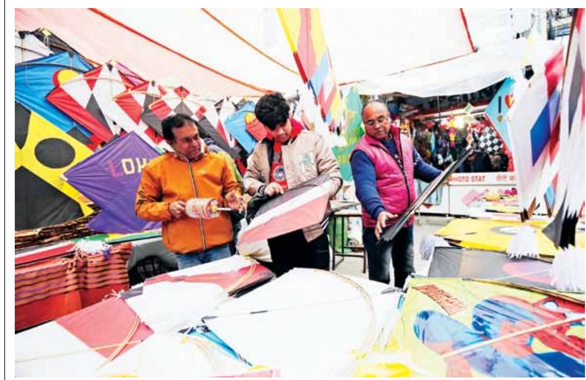
People purchase kites on the eve of Lohri festival at a market in Amritsar on Friday. The Lohri harvest festival, which falls on January 13 this year, is marked in northern India with celebrations involving the flying and battling of kites

The matches will be broadcast live in India on Sports 18 and streamed on Jio Cinema.