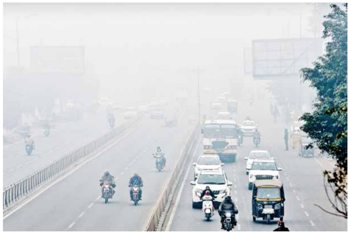
Commuters make their way along a street amid dense fog on a cold winter morning in Amritsar on Thursday. The Indian Meteorological Department (IMD) Thursday forecasted that very dense fog conditions are likely to continue to prevail over North India for the next 4-5 days causing disruption in flight services.