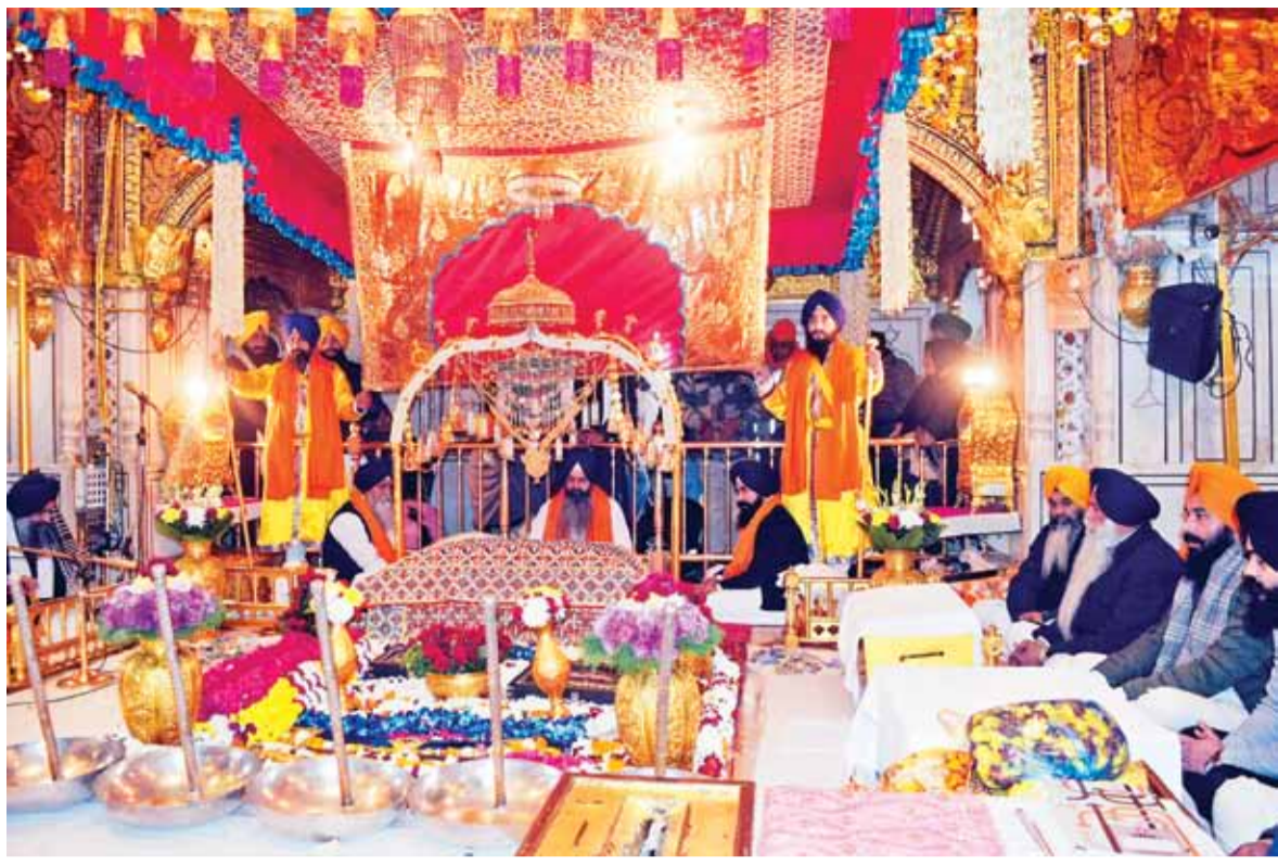
A Sikh priest sits behind the Guru Granth Sahib (Sikh's Holy book) during a display of Sikhism's symbolic items at Sri Harmandir Sahib in Amritsar on Wednesday, on the occasion of Parkash Parv of tenth guru of Sikhs Guru Gobind Singh.