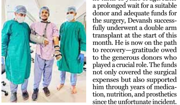
People in medical attire.