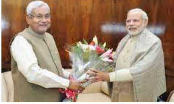
Nitish Kumar and Narendra Modi.

A big news is now coming amidst the strained relations between JDU and RJD in Bihar for the last few days. According to information received from sources, Nitish Kumar can form a new government on Sunday. If sources are to be believed, CM Nitish Kumar may change sides and join with BJP again. And only after this will he stake claim to form a new government. According to the information received, Nitish Kumar has canceled all his previously scheduled programs on Sunday.