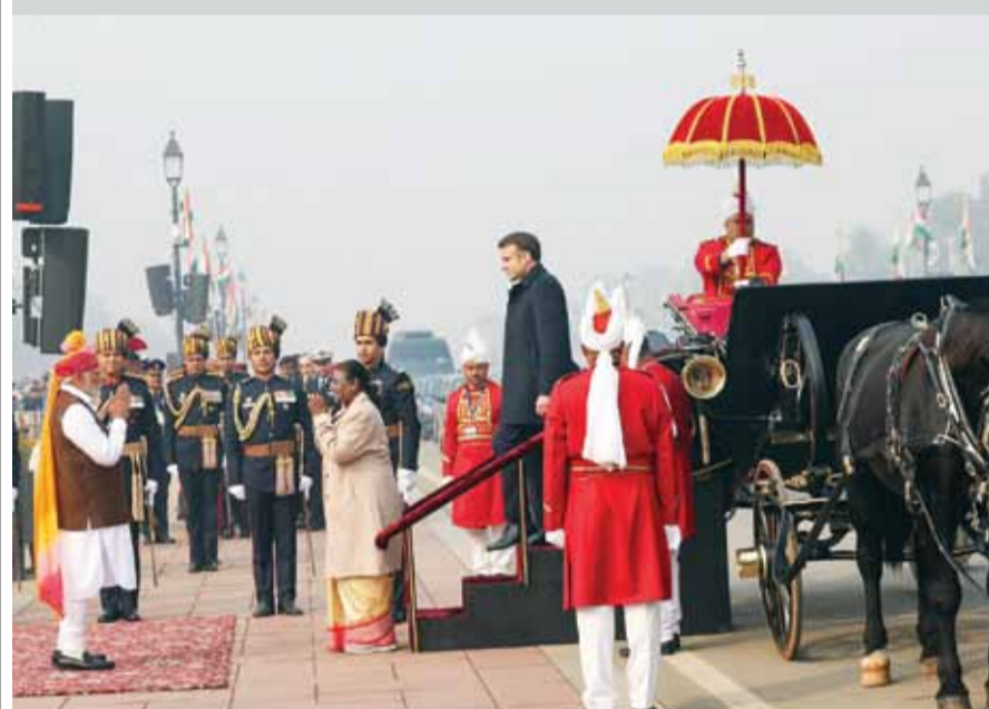
NEW DELHI: The Prime Minister, Shri Narendra Modi has greeted every citizen on the special occasion of the 75th Republic Day.