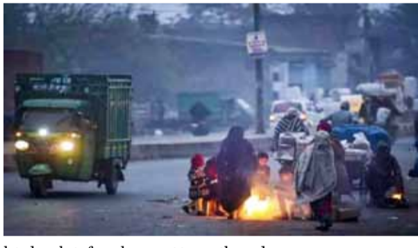
People sitting on the ground in a cold environment.

NEW DELHI: Jet stream winds, of the order of 130-160 knots at 12.6 km above mean sea level, are still prevailing over the plains of North India, enhancing cold wave/cold day conditions which are likely to continue for next 3-4 days, the India Meteorological Department (IMD).