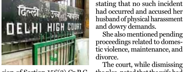
The entrance of the Delhi High Court.

NEW DELHI: The Delhi High Court has imposed a penalty of Rs 25,000 on a husband who sought the registration of a purportedly false rape case against his wife's cousin, cautioning against frivolous complaints that could potentially harm innocent individuals.