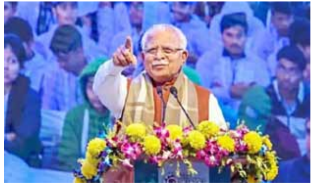
Manohar Lal Khattar speaking at a podium.

Haryana Chief Minister Manohar Lal Khattar said that there is a committed effort to enhance education in science and technology in the state of Haryana. He said, government will establish a Science City on 50 acres in either Faridabad or Gurugram district to promote new scientific research and innovations. Khattar as the Chief Guest during the closing ceremony of the 9th India International Science Festival held at THSTI Biotech Institute, Faridabad. He said that today Haryana has got the opportunity to host this 9th Science Festival congratulating on the successful organization highlighted the participation of students, teachers, researchers, scientists, entrepreneurs, educators, startups, and international representatives in the Science Festival. He commended all participants for their contributions. CM stated that the Science Festival showcases India's