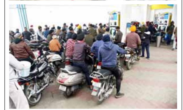
People wait for fuel at a gas station in Amritsar on Tuesday. A nationwide strike called by transport associations has caused disruption in fuel supply. The strike was called to protest against stringent jail and penalty regulations for hit-and-run cases.