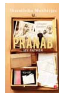
Pranab, My Father: A Daughter Remembers By Sharmistha Mukherjee Rupa, 368 pages; Rs 595

The book also sheds light on the personal relationships that Pranab Mukherjee nurtured, notably with Sheikh Hasina, the Prime Minister of Bangladesh. The emotional depth of these ties is poignantly illustrated at Geeta Mukherjee's funeral, attended