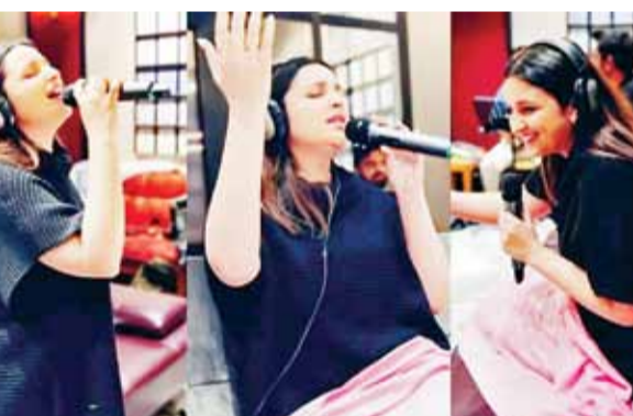
Talking about her acting career, Parineeti, who made

wrote: "From my soul to stage very soon." On January 25, Parineeti announced her foray into the world of music, for which the actress said she feels lucky and blessed to start a new chapter and "embark on this musical journey." She even shared a video of her singing 'Maana Ke Ham', which she originally sang in the 2017 romantic movie 'Meri Pyaari Bindu', starring her alongside Ayushmann Khurrana.