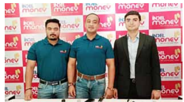
ARUN KUMAR RAO Bengaluru

Indel Money Limited, one of the fastest growing NBFC in the gold loan sector, announced the 4th public issue of Secured NCDs of face value of Rs.1,000 each. The Issue opens on Tuesday, January 30, 2024 and closes on Monday, February 12, 2024 (with an option of early closure in case of early over-subscription). Doubling of investment in 72 months - Option VIII Coupon yielding up to 12.25% per annum Secured NCDs with tenure ranging from 366 days to 72 months, Minimum application size 10 NCDs (Rs.10,000) across all Options of NCDs.