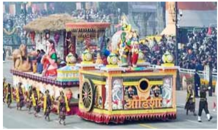
tableau award was given to Odisha's Woman Empowerment in Viksit Bharat, followed by Gujarat (Dhordo: A Global Icon of Gujarat's Border Tourism) and Tamil Nadu (Kudavolai System in ancient Tamil Nadu -- Mother of Democracy).

Odisha was adjudged the best state/ union territory (UT) tableau by a panel of judges whereas Sikh Regiment Contingent as best marching contingent among the three services, and Delhi Police Women Contingent named best marching contingent among Central Armed Police Forces (other auxiliary forces in both categories), an Ministry of Defence (MoD) official said. The MoD in a statement added that best states/UTs