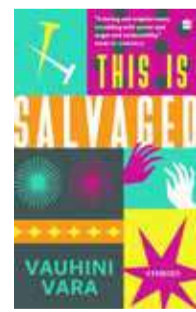
This Is Salvaged By Vauhini Vara Fourth Estate, 208 pages; ₹399

Vara's prose is both affecting and evocative, capable of capturing the essence of the human spirit in a single line. Her voice, hailed as original and assured in her debut, resonates with even greater clarity and inventiveness in this collection. It's a voice that cares deeply, not just for the characters it brings to life, but for the broader human experience it seeks to explore.