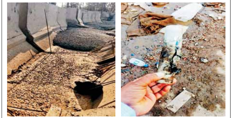
Farmers' Protest continues...