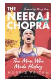
The Neeraj Chopra Story By Norris Pritam Bloomsbury 236 pages; Rs 399

The inclusion of perspectives from Chopra's rivals and legends of the sport, like Klaus Wolfermann, lends credibility and depth to the narrative. Pritam also addresses controversies, such as the javelin use during the Tokyo