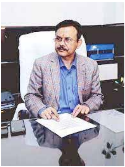
Commercial Manager (CCM), Northern Railway, Group General Manager (North Zone), IRCTC, Divisional Railway

His impressive leadership roles include Principal Chief