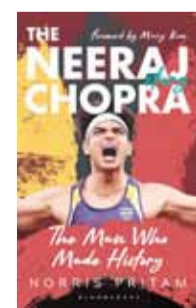
The Neeraj Chopra Story By Norris Pritam Bloomsbury 236 pages; Rs 399

The inclusion of perspectives from Chopra's rivals and legends of the sport, like Klaus Wolfermann, lends credibility and depth to the narrative. Pritam also addresses controversies, such as the javelin use during the Tokyo