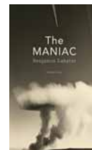
The Maniac By Benjamin Labatut Pushkin Press; 368 pages; Rs 699

Labatut's work stands out for its willingness to confront the "unpopular" aspects of science—the human costs and moral questions that often go unexamined in more celebratory accounts. Through the figure of von Neumann and the diverse cast of characters that surround him, the novel presents a multifaceted view of scientific endeavor, one that ac-