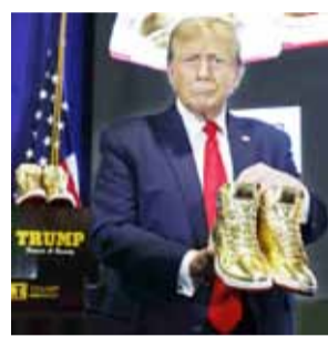
talked about for 12 years, 13 years, and I think it's going to be a big success," said Trump, the frontrunner in GOP nominations in a potential rematch between him and President Joe Biden for 2024 presidential elections.

The former president unveiled "Trump Sneakers" at Sneaker Con in Philadelphia. He placed a pair of gold sneakers, which a new website priced at $399 and named the "NEVER SURRENDER HIGH-TOP SNEAKER", on the podium as he spoke, media reports said. "This is something I've been