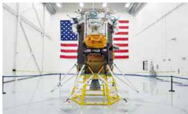
The spacecraft was launched on a SpaceX Falcon 9 rocket on Thursday last week from NASA's Kennedy Space Center in Florida. The mission, code-named IM-1, marks Intuitive Machines' first robotic flight to the moon's surface, Xinhua news agency reported.

US company Intuitive Machines' first lunar lander has touched down on the moon, marking the first American spacecraft to land on the lunar surface in more than 50 years.