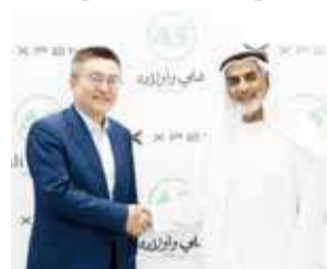
to local consumers, including: Egypt, RAYA Azerbaijan, SR Group Jordan, T Gargour and

As part of XPENG's international expansion plans, a growing list of new partners from XPENG's strategic markets have joined XPENG in bringing the brand's latest smart EVs