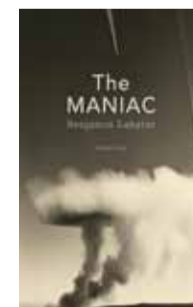
The Maniac By Benjamin Labatut Pushkin Press 368 pages; Rs 699

Labatut's work stands out for its willingness to confront the "unpopular" aspects of science—the human costs and moral questions that often go unexamined in more celebratory accounts. Through the figure of von Neumann and the diverse cast of characters that surround him, the novel presents a multifaceted view of scientific endeavor, one that ac-