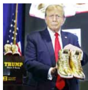
talked about for 12 years, 13 years, and I think it's going to be a big success," said Trump, the frontrunner in GOP nominations in a potential rematch between him and President Joe Biden for 2024 presidential elections.

The former president unveiled "Trump Sneakers" at Sneaker Con in Philadelphia. He placed a pair of gold sneakers, which a new website priced at $399 and named the "NEVER SURRENDER HIGH-TOP SNEAKER", on the podium as he spoke, media reports said. "This is something I've been