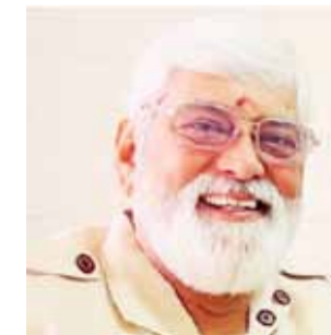
FW DESK New Delhi