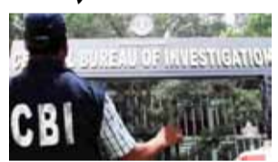
tancy firms and travel agents allegedly sending youths to the Russia-Ukraine war zone in the guise of lucrative jobs.

Information reveals that multiple teams of the CBI conducted searches at around 15 places in seven cities across the country including Delhi, Mumbai, Thiruvananthapuram, Ambala, Chandigarh, Madurai, and Chennai. During searches, the CBI has recovered a large number of incriminating documents and records. CBI spokesperson said that searches are still going on and certain suspects have also been detained for questioning at various locations. He disclosed that around 35 instances of victims sent abroad have been established.