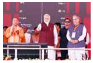
Buildings at Kadapa, Hubballi, and Belagavi Airports.

Additionally, he laid the foundation stone for three new Terminal