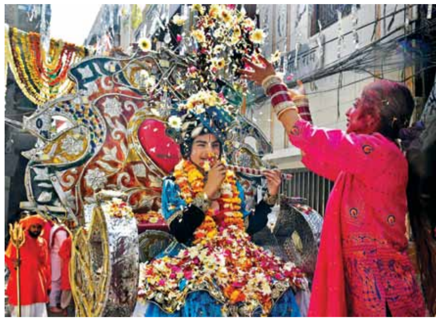
Hindu devotees celebrate Holi, the spring festival of colours, with flower petals during the festival celebrations at a temple in Amritsar on Thursday. Holi is the Hindu religious spring festival celebrated by Hindus as a festival of colours