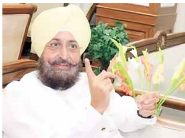
abuse from the state and doing justice on the sacrilege of Guru Granth Sahib.

CHANDIGARH: After the Aam Aadmi Party (AAP) legislator from Amritsar (North) Kunwar Vijay Pratap Singh accused his own party of having failed to fulfill its promises on drugs and sacrilege, Leader of the Opposition Partap Singh Bajwa on Monday said now party leaders also started exposing the misdeeds of the party.