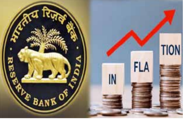
The article prepared by RBI Deputy Governor Michael Patra and other officials noted that extreme weather events, as warned by the World Meteorological Organisation, could impact inflation alongside prolonged geopolitical tensions affecting crude oil prices.

MUMBAI: The Reserve Bank of India (RBI) has warned that adverse weather conditions and extended geopolitical conflicts leading to volatile crude oil prices may pose a threat to inflation in the near term. In its monthly bulletin, the RBI stated that consumer price index (CPI) inflation moderated to 4.9 per cent in March after averaging 5.1 per cent in the preceding two months. However, food inflation remains elevated, posing a risk to the disinflation trajectory. The central bank highlighted that careful monitoring during the summer is warranted as overlapping food price shocks play