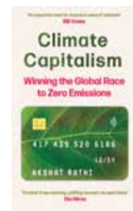
Climate Capitalism By Akshat Rathi; John Murray/ Hachette; 272 pages; Rs 699

However, the journey Rathi describes is fraught with challenges. The political landscape is often hostile to drastic changes, and the vested interests in fossil fuels are robust and influential. Moreover, the disruption caused by transitioning to new technologies can