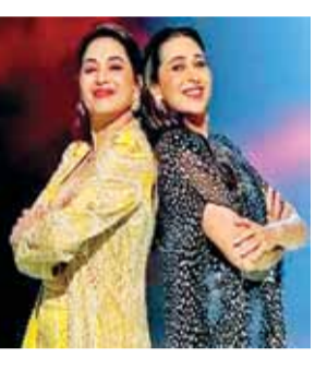
channel on Instagram showcased the two actresses recreating the iconic face-off

MUMBAI: Actresses Madhuri Dixit Nene and Karisma Kapoor will set the stage on fire as they will be seen recreating the magic of the 'Dance of Envy' from the iconic 1997 film 'Dil Toh Pagal Hai'. Karisma will be a guest on the upcoming episode of the reality show 'Dance Deewane'. She will be joining Suniel Shetty, with whom she worked in 'Rakshak' and her 'Dil To Pagal Hai' co-star Madhuri Dixit Nene. A promo shared by the