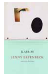
Kairos By Jenny Erpenbeck, Translated by Michael Hofmann New Directions 293 pages; Rs. 1,040.

East Berlin, in Erpenbeck's hands, is not merely a setting but a dynamic character that underscores the fleeting nature of love and socialist ideals. Katharina's