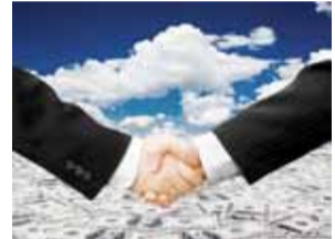
FW DESK Kuala Lumpur (Malaysia)

VCI Global Limited, is pleased to announce plans to facilitate the Capital Raising of no less than US$210 million for Magnum Mining & Exploration Limited (ASX: MGU) ("Magnum") through its subsidiary, V Capital Consulting Limited (VCLL).