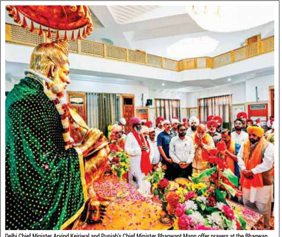
Delhi Chief Minister Arvind Kejriwal and Punjab's Chief Minister Bhagwant Mann offer prayers at the Bhagwan Sri Valmiki Tirtha Sthal, the holy place of Sri Amritsar Sahib, on Friday.

Highlighting the rationale behind this change, Kris Gopalakrishnan, President, Infosys Science Foundation, said, "Since its inception 15 years ago, ISF has recognized and awarded 92 brilliant minds across disciplines in a demanding global environment.