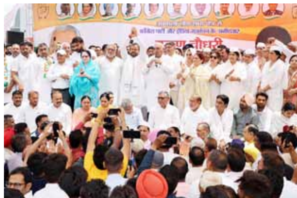
PARVESH HANDA Ambala

Former Haryana chief minister and leader of opposition in Haryana Vidhan Sabha Bhupinder Singh Hooda on the occasion of filing the nomination papers by Varun Mullana former Barara MLA for Lok Sabha seat alongwith HPCC president Ch. Uday Bhan addressed a large gathering in Ambala City, said that the present Lok Sabha polls are not only polls but also a fight to save democracy in the country, for which different political parties in the country have also constituted I.N.D.I.A to fight against the ruling BJP government jointly by '36 Biradaris' to bring Congress in power not only in Haryana state but all over in the country.