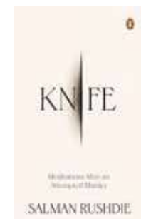
Knife By Salman Rushdie Hamish Hamilton, 224 pages; Rs 699.

What makes "Knife" compelling is not just Rushdie's recounting of his ordeal but his reflections on the concept of freedom itself, a theme that has defined much of his work and life. In today's fractured world, where the principle of free speech