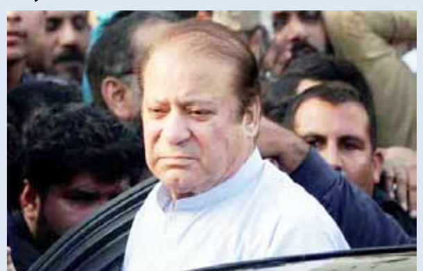
Awaiting GHQ Response

The diplomatic circles in New Delhi and Islamabad, are abuzz with a number of issues, which might have been discussed during the visit. They might have included setting up an industrial complex for producing cheaper Chinese goods in Pakistan for exports to the neighboring countries. It might include supplies to India, where despite repeated anti-China rhetoric in media as well as at the government level, India has imported goods worth USD 117 billion in 2023, according to a UN report.