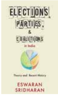
Elections, Parties, and Coalitions in India: Theory and Recent History By Eswaran Sridharan Permanent Black; 372 pages; Rs 1,095.

Sridharan highlights the limitations of these conventional theories when applied to India's unique political landscape. Among the key findings of Sridharan's work is the impact of the first-past-the-post system on coalition politics. Unlike proportional representation systems where post-electoral alliances are common, first-past-the-post incentivizes pre-electoral coalitions to avoid vote wastage. Additionally, a small vote swing in this system can disproportionately affect seat shares, making third-placed parties or candidates pivotal players if they strategize effectively. Sridharan also explores the federal dimensions of coalition politics in India. He notes that the division of power between multiple levels of government makes state-level power attractive, leading to the