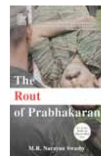
The Rout of Prabhakaran By M.R. Narayan Swamy Konark Publishers 432 pages; Rs 895.

Swamy also addresses the peace process in Sri Lanka, noting the irony that the LTTE entered negotiations in 2002 at the height of its power, not out of desperation. However,