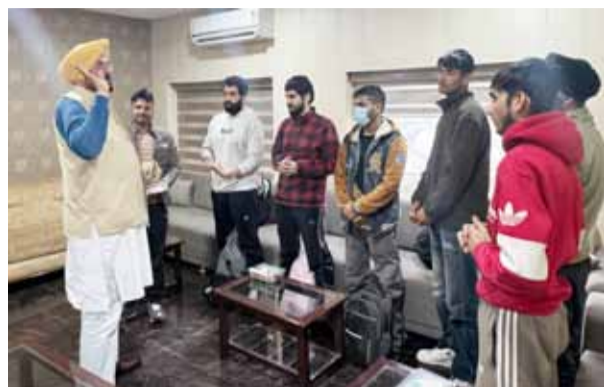
Dhaliwal urged the Modi government to seek assistance from Indian embassies in America for the deportation of Indians living illegally in the US. He emphasized that Prime Minister Narendra Modi and External Affairs Minister Jaisankar should communicate to the US government that deported Indians should be handed over to Indian embassies for safe return.

Cabinet Minister Punjab Kuldeep Singh Dhaliwal has condemned the mistreatment of 104 Indians deported from America, citing gross human rights violations. The youths were allegedly handcuffed and chained during their 17-18 hour flight from America to Amritsar on a military cargo plane.