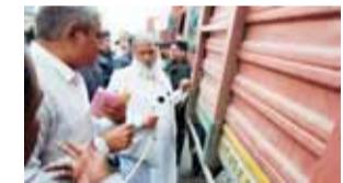
Chandigarh/ Ambala

Addressing media persons, Haryana's Energy, Transport and Labor Minister Anil Vij said that The Haryana Transport Department will start bus services from every district of the state for the Kumbh being organized in Prayagraj. He stated that one bus will be operated from each district for Kumbh and this service will run daily from every district. Vij added that the bus service will commence from every district starting today.