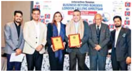
FW DESK Amritsar