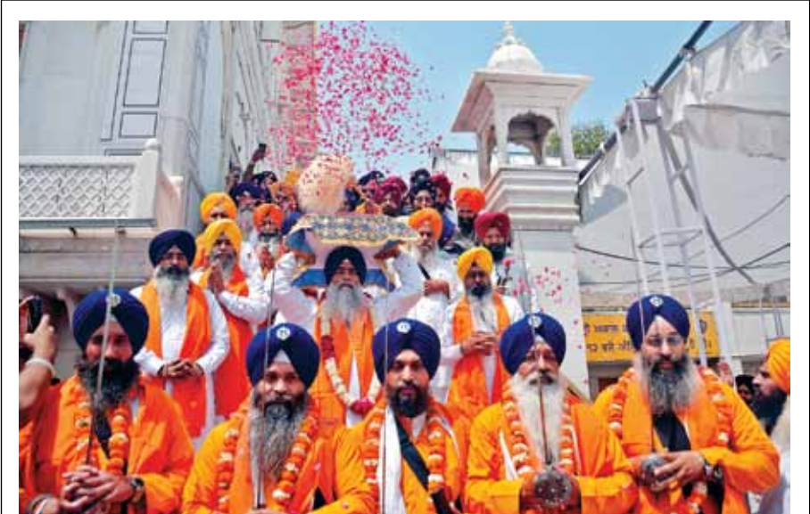
A Sikh priest carries the Guru Granth Sahib (Sikh holy Book) during a religious procession on the eve of the birth anniversary of the 9th Sikh Guru, Guru Teg Bahadur ji at Sri Harmandir Sahib on Thursday, April 17, 2025.

Rahman is also excited about the upcoming Hansal Mehta series on Gandhi, which is headlined by Pratik Gandhi. "The Gandhi series is unexpectedly beautiful; I never expected that to be such a beautiful experience. Working with Hansal Mehta and Sameer Nair was fascinating. Even Gandhi ji's life... I feel that's like a textbook, and it's a fantastic textbook for the previous or the future generations to see the father of the nation," he said. Meanwhile, Rahman attended the MAMI Film Festival 2025, in Mumbai, on Tuesday.