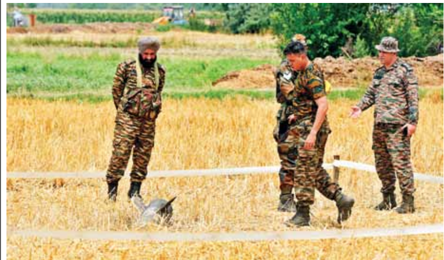
Army personnel inspecting the missile shell that landed, a missile type explosive was found in the fields of Village Makhiwind, about 25 km from Amritsar on Thursday, May 8, 2025.