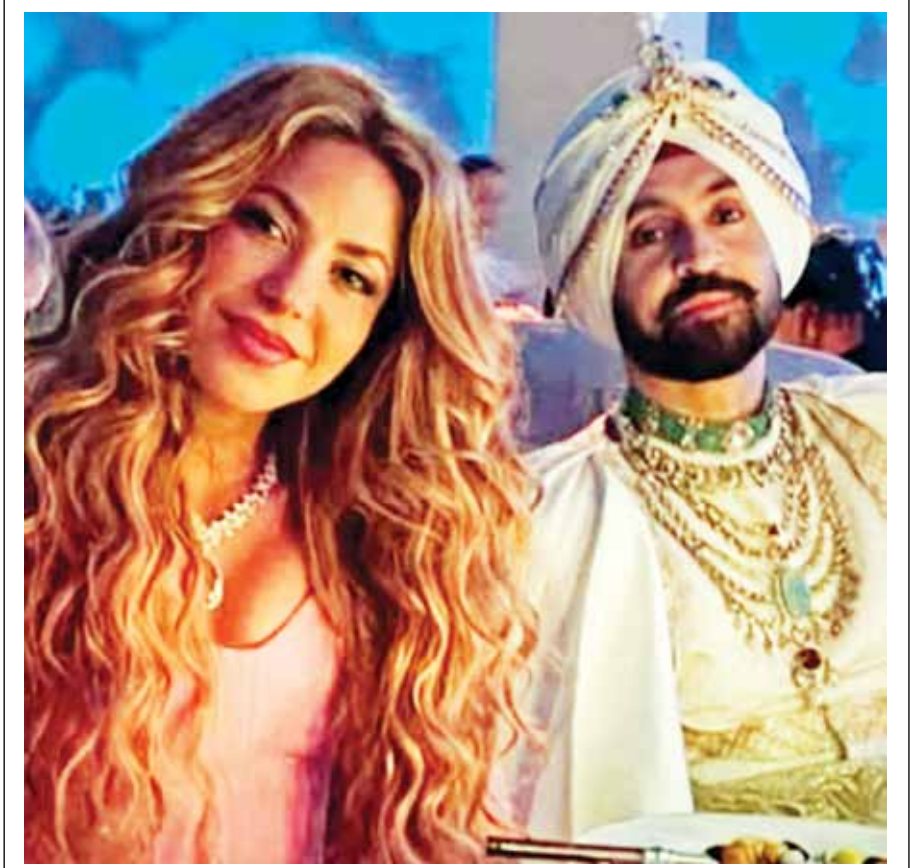
MET Gala 2025 featuring Shakira with Diljit Dosanjh