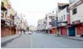
JAGMOHAN SINGH Amritsar

Complete bandh was observed here in the city as protesters took out march through markets and even inside the old walled city where small shopkeepers were forced to close their shops to protest the terror attack in Pahalgalam that claimed lives of 26 innocent people, most of them tourists, on Tuesday.