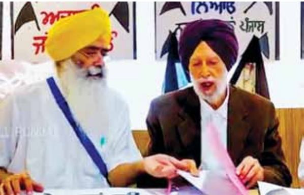
Former VC Panjabi University Boparai urged for complete autonomy to varsities