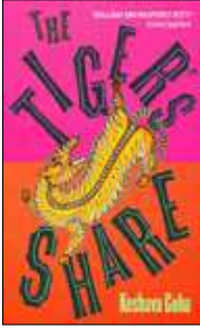
The Tiger’s Share by Keshava Guha; Hachette India; 320 pages; Rs455

fiction as a private artistic pursuit, one not designed to change the world but to fulfil a deep imaginative impulse. That modesty is reflected in the novel’s controlled ambition—it does not preach, but it does persuade. Guha is alert to the lie that fiction can tell, in service of a greater truth. The families he writes about are imagined, but their dilemmas are achingly real. The inheritance wrangles, the environmental degradation, the ideological drift between generations—none feel exaggerated. The author brings lived experience to bear, having observed, rather than drawn from, Delhi’s power elite. His depiction of the patriarchal default in inheritance practices is especially sharp, revealing how entrenched inequalities are not always the product of explicit malice, but of longstanding social habits. The environmental theme—quietly seeded throughout the narrative—becomes clearer as the novel moves toward its close. Guha reveals that the book’s origin lay in the idea of someone taking a drastic step