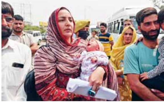
A Pakistan national bids goodbye to her Indian relatives as she leaves in a bus at the Attari-Wagah border between India and Pakistan, following New Delhi’s decision to order almost all Pakistani citizens to leave the country after last week’s deadly attack in Indian-controlled Kashmir.